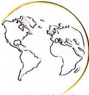
Living The Golden Rule.

These excerpts are from a collection of letters written to high school principals called Notes for Change. On the final day of ANYTOWN, participants were asked to think about their week-long experience and reflect on how they would apply their newfound knowledge once they returned home. They were asked to write letters to their principals and share their ideas. These letters proved to be insightful and inspirational. Here are some excerpts from the 2009 ANYTOWN Notes for Change.